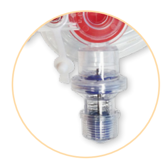
Adjustable PEEP Valve Attaches directly to flow diverter