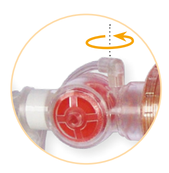
360° Swivel Oxygen Tubing Connector