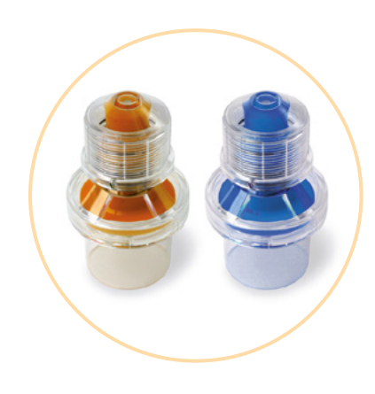
Adjustable PEEP valves attach directly to flow diverter.